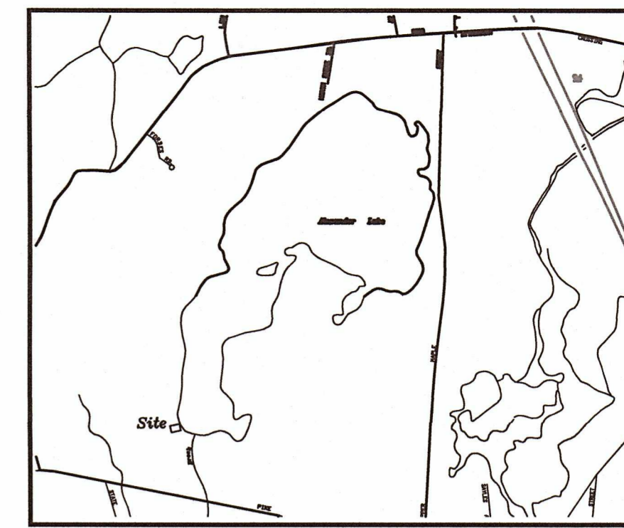
Location Map SCALE 2000 0 2000 1" = 2000 FT